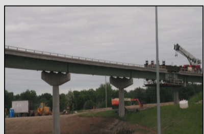
I-135 / Kellogg Construction

Since then, 36 projects in the region have received TE awards, 27 of which are bicycle / pedestrian facilities.