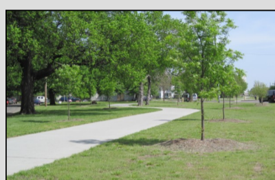
Midtown Greenway multiuse path in Wichita

WAMPO will update the Congestion Management Process (CMP) in 2011. The CMP helps identify strategies to mitigate emissions caused from motor vehicles.